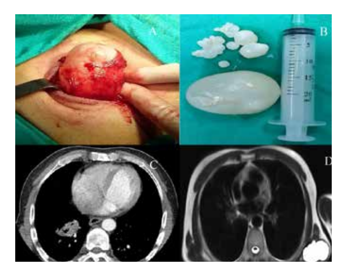
Figure 1. A three-dimensional computed tomography scan showing an expanding cystic mass in the 9th and10th ribs with destruction of the vertebral transverse process, seen in the (A) anterior and (B) anterior view with soft tissue; and conventional thorax CT of the Axial (C) and coronal (D) images show destruction in the ninth and tenth ribs.

localization of HCs are extremely rare and differentiated from other bone ones with destruction in rib or bone matrix and rupture risk for surrounding tissues and recurrence. First of all, it is localized in calcium-containing bone although it is porous, unlike soft tissue. Dew has demonstrated it; embryos have been restricted to bone due to high vascularity and have been found to invade other bone and peripheral tissue fragments.